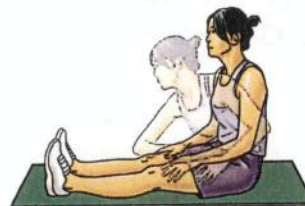
THORACIC SIDE STRETCH

7. THORACIC SIDE STRETCH: To stretch your right upper back, point your right elbow and shoulders forward while twisting your trunk to the left. Hold for a count of 15. Repeat 3 times. To stretch your left upper back, point your left elbow and shoulder forward while twisting your trunk to the right. Hold for a count of 10. Repeat 3 times.