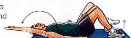
DEAD BUG EXERCISE

3. PARTIAL CURL: Lie on your back with your knees bent and your feet flat on the floor. Tighten your stomach muscles and flatten your back against the floor. Tuck your chin to your chest. With your hands stretched out in front of you, curl your upper body forward until your shoulders clear the floor. Hold this position for 3 seconds. Don't hold your breath. It helps to breathe out as you lift your shoulders up. Relax. Repeat 10 times. Build to 3 sets of 10. To challenge yourself, clasp your hands behind your head and keep your elbows out to the side.