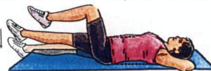
LOWER ABDOMINAL EXERCISE

5. LOWER ABDOMINAL EXERCISE: Lie on your back with one knee bent at a 90 degree angle so your shin is horizontal. Your other foot should be just above the floor. Hold yourself in a pelvic tilt by tightening your abdominal muscles and pushing your lower back into the floor. Your knees should be pointed toward the ceiling. Slowly lower and straighten the top leg until the foot barely touches the floor and then bring it back up to the starting position. Do the same with your other leg. Remember to hold the pelvic tilt while you lower each leg. Do 3 sets of 10 on each side.